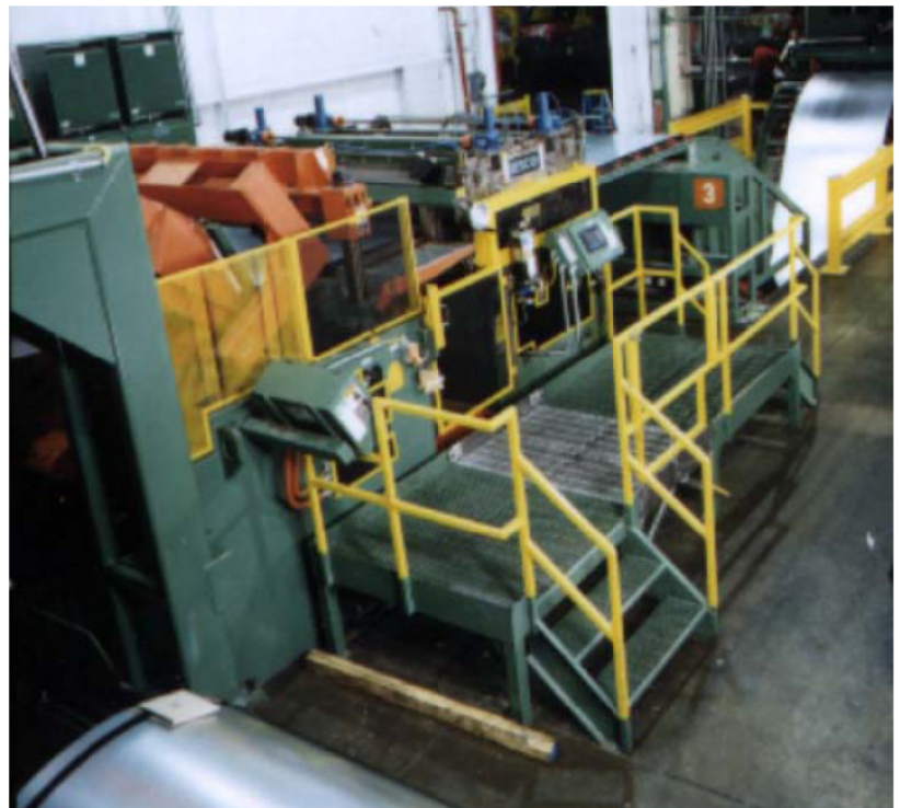
84" wide x 70,000# Blanking Line on Blow Press